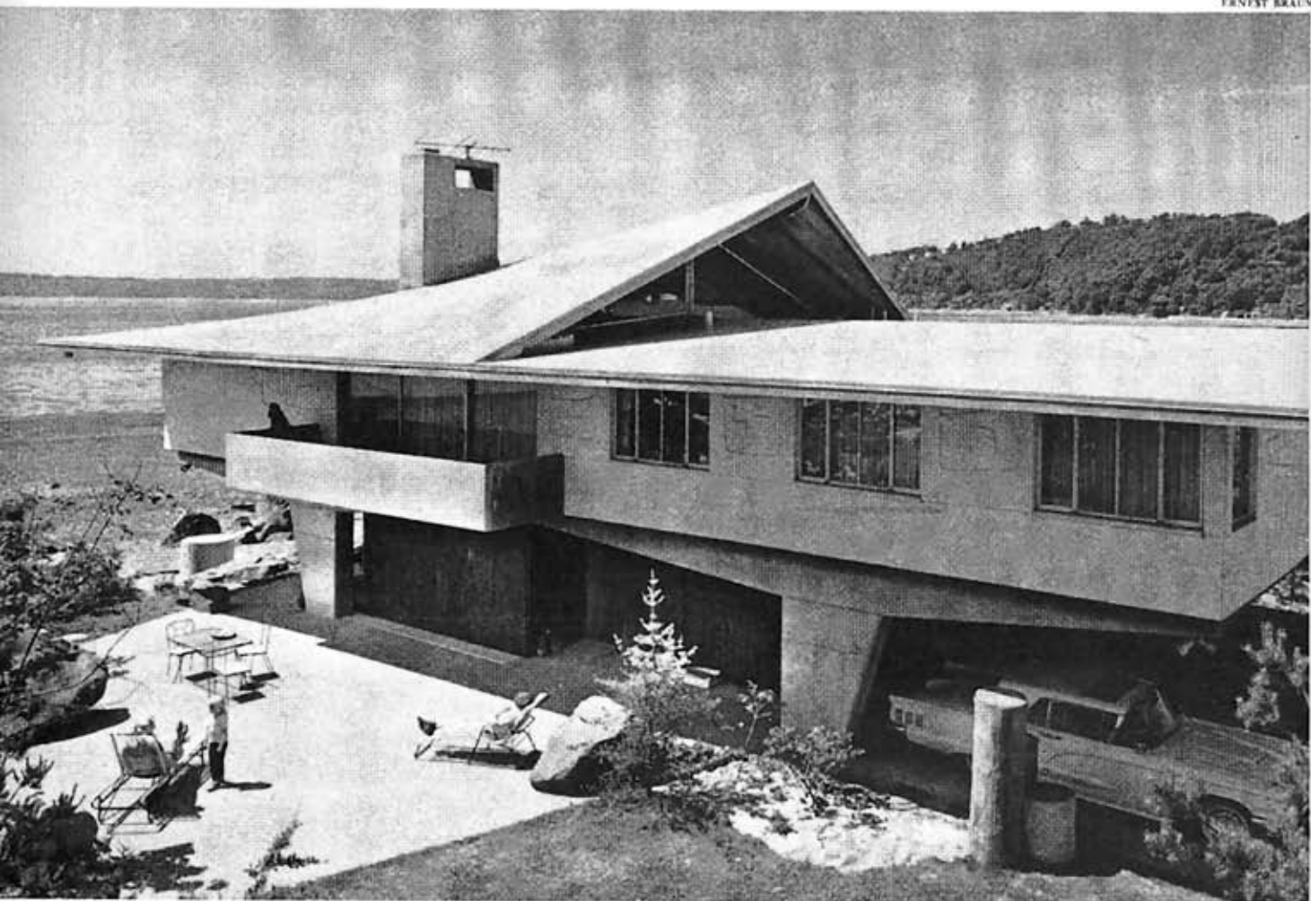
Roof over living areas was designed to lift wind as it sweeps across. Recessed clerestory windows let in the early morning sun