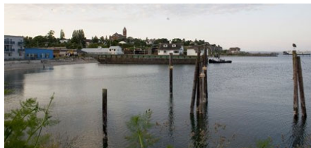
Two houses that were removed from lots in Victoria, B.C., were brought by barge to Port Townsend last week for delivery to new owners. The Canadian company that moved the houses, Nickel Brothers, specializes in moving buildings, and maintains an inventory of recycled houses and other buildings on its website.

Clear glass goes in one container, colored another.