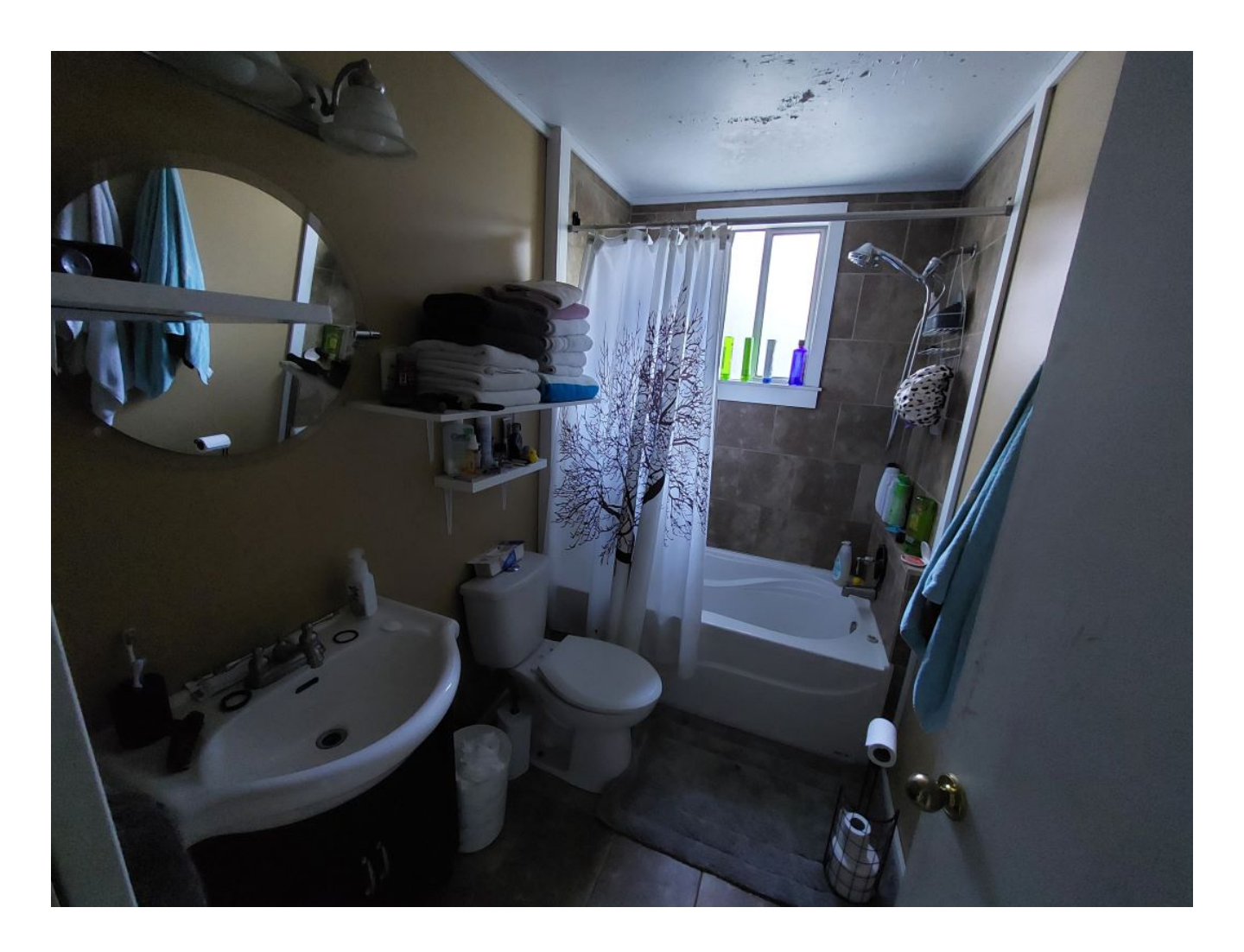
See the listing online at <a href="https://www.nickelbros.com/residential/homes/port-alberni-proper/">https://www.nickelbros.com/residential/homes/port-alberni-proper/</a>.

Price includes house with local delivery and lowering onto foundation. Prices may vary based on final location, site accessibility, utility line work involved and/or barging requirements.